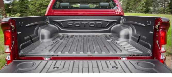
Massive Industry Leading Cargo Pan 62 inches long x 62 inches wide Total Load Capacity of 1.5 Ton

Legendary 2.8L Cummins Turbo Diesel Engine Power and Reliability