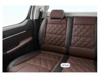
Luxury Quilted Pattern Synthetic Leather Seats

+501-224-4222 +501-823-0150 +501-615-7185 +501-615-1327