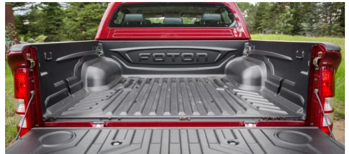
Massive Industry Leading Cargo Pan 62 inches long x 62 inches wide Total Load Capacity of 1.5 Ton