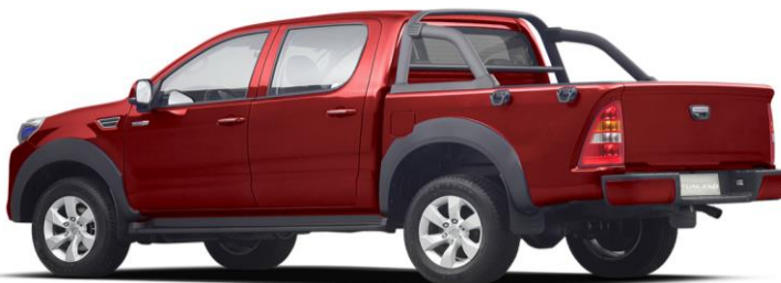
220 mm Ground Clearance for Capable Off-Roading