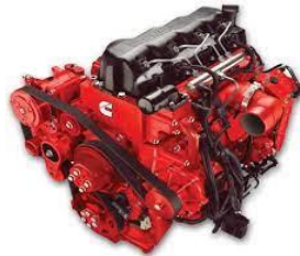
Legendary 2.8L Cummins Turbo Diesel Engine Power and Reliability